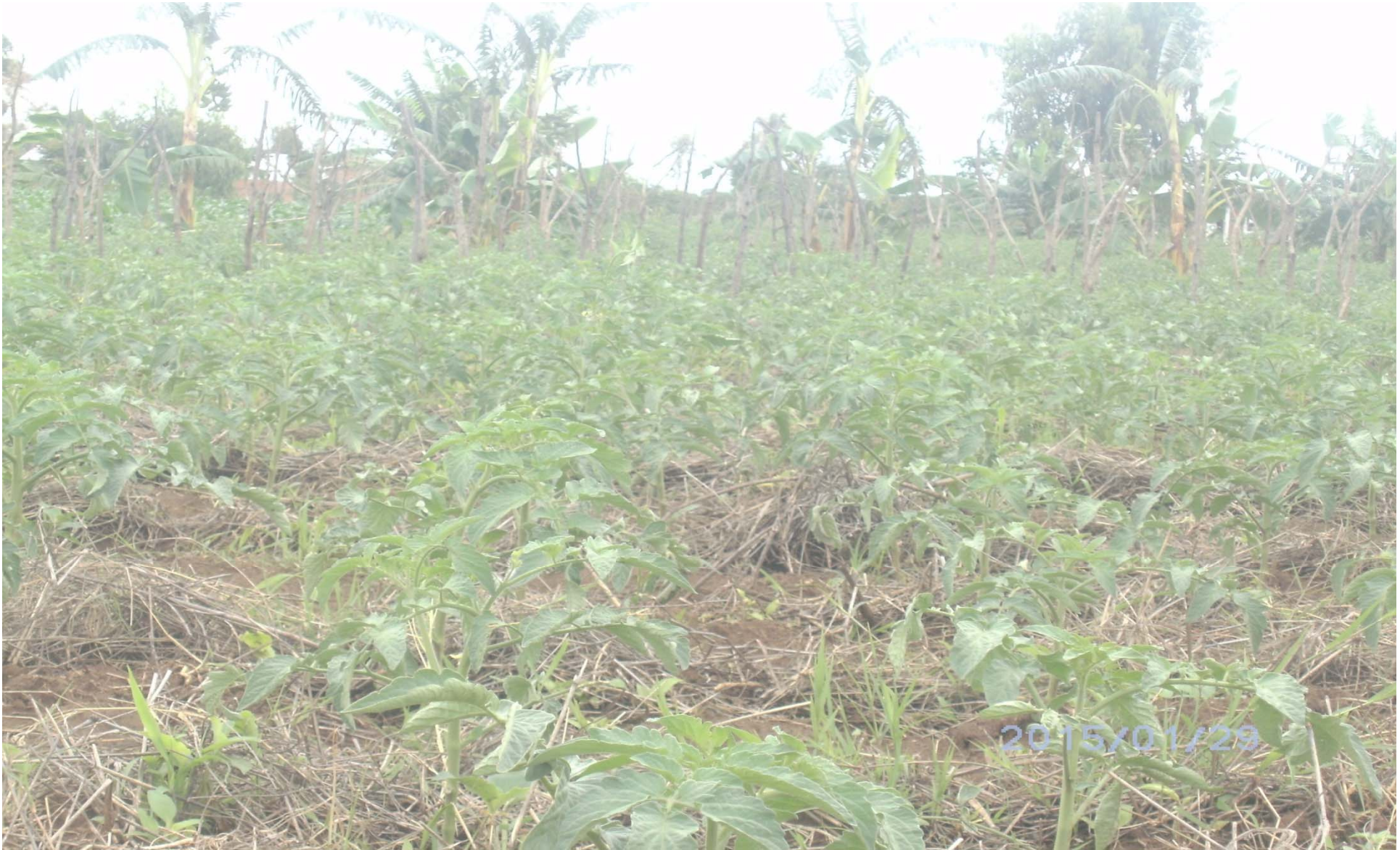
TOMATOES & BANANAS @ MCHINJI FARM