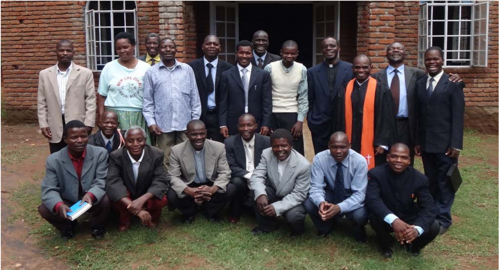
GROUP PHOTO WITH FACILITATORS