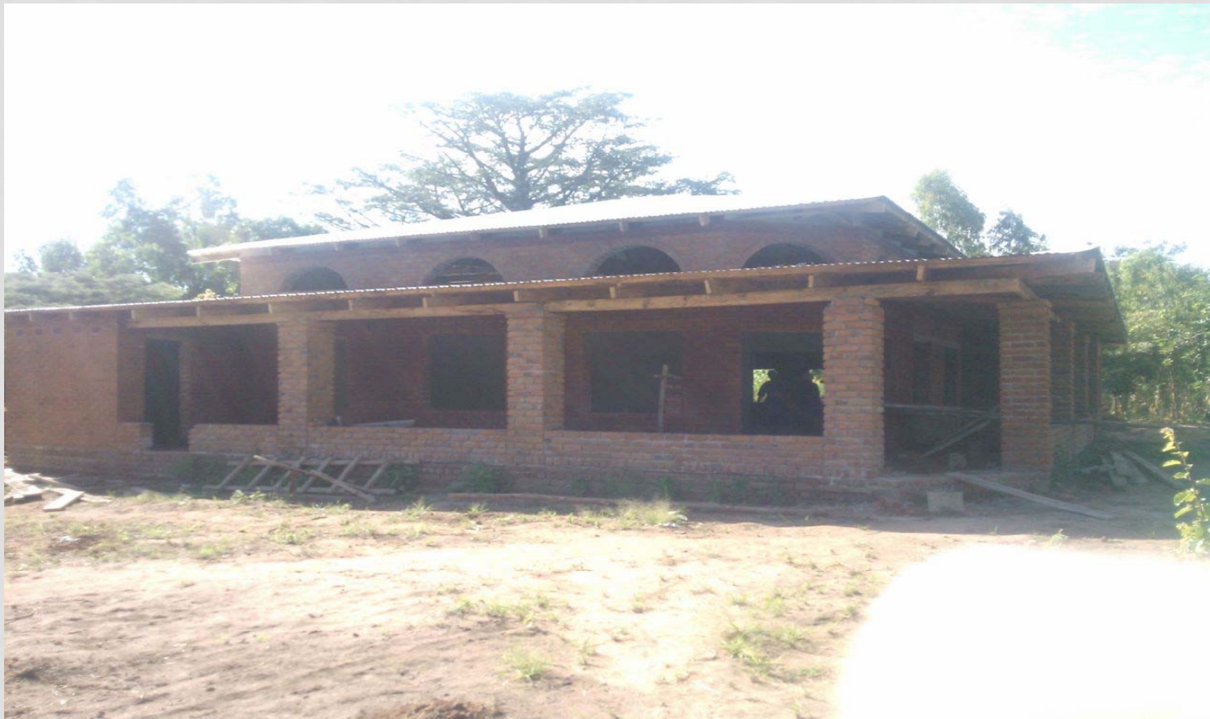
2015: MULTIPURPOSE BUILDING UNDER CONSTRUCTION :MIGOWI UMC