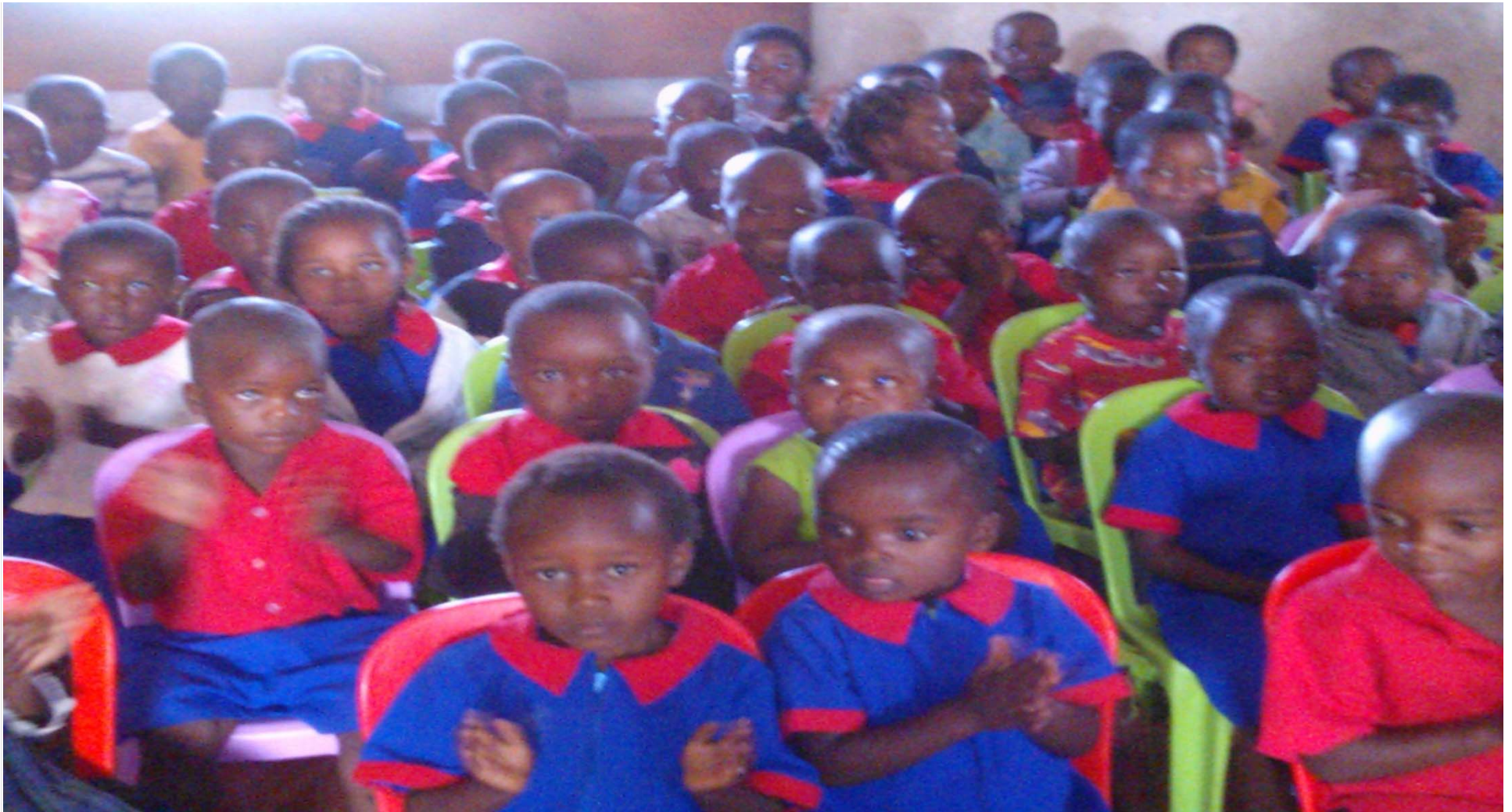
CHILDREN IN CLASS-MANGULAMA SCHOOL