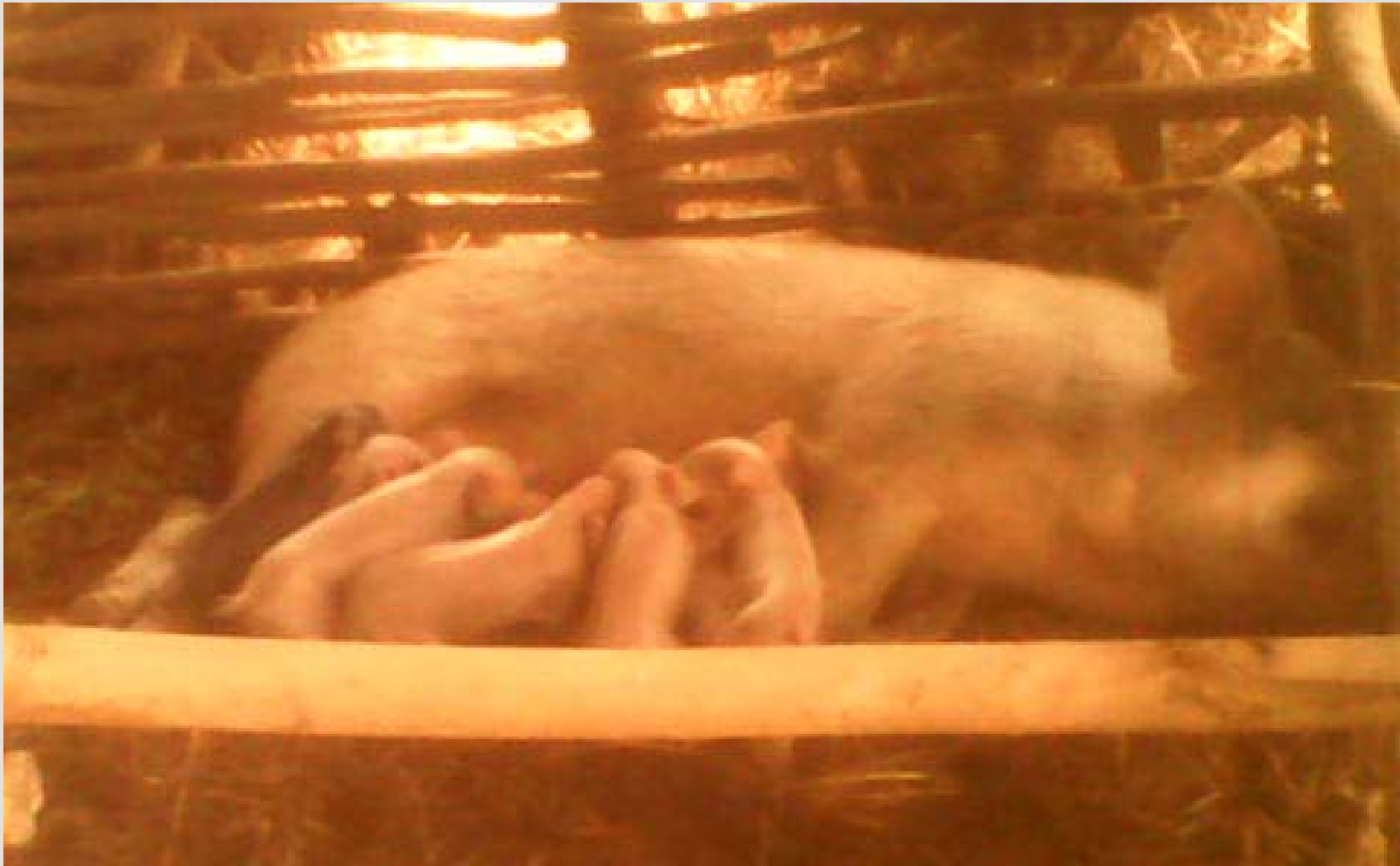
PIG DINKY WITH HER 6 BABIES @ FARM