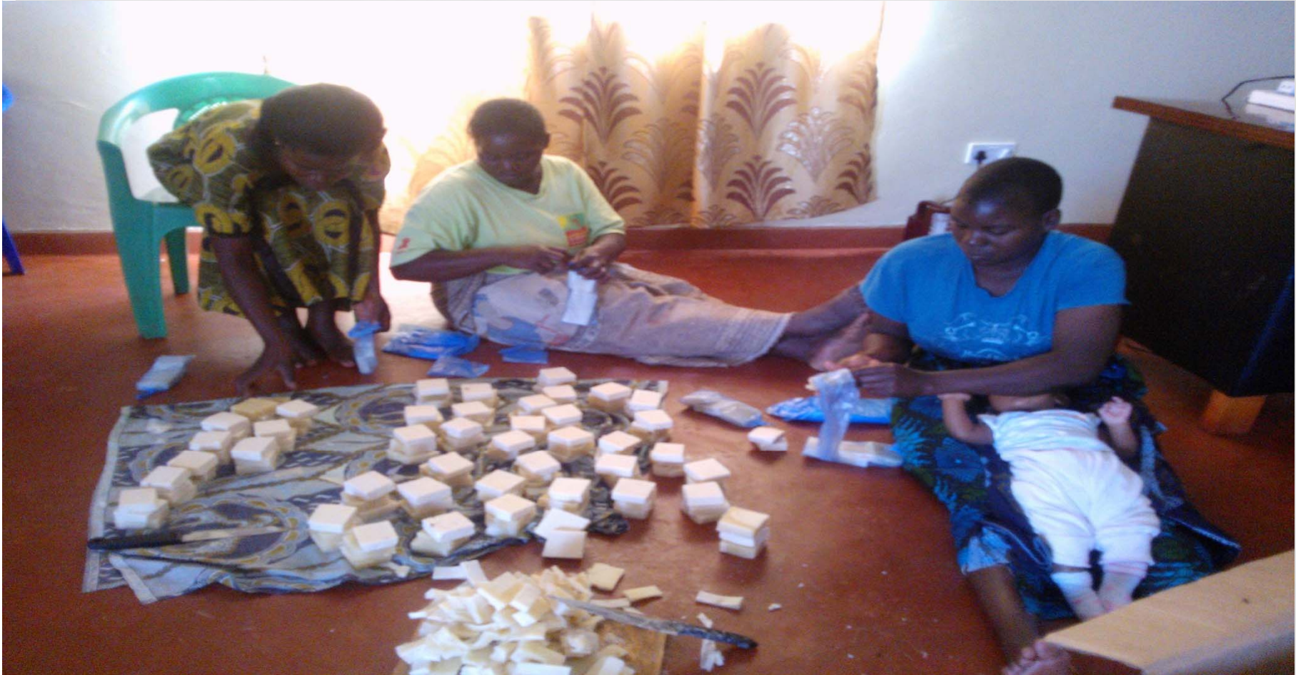
SOAP MAKING BY WOMEN IN MADISI CIRCUIT