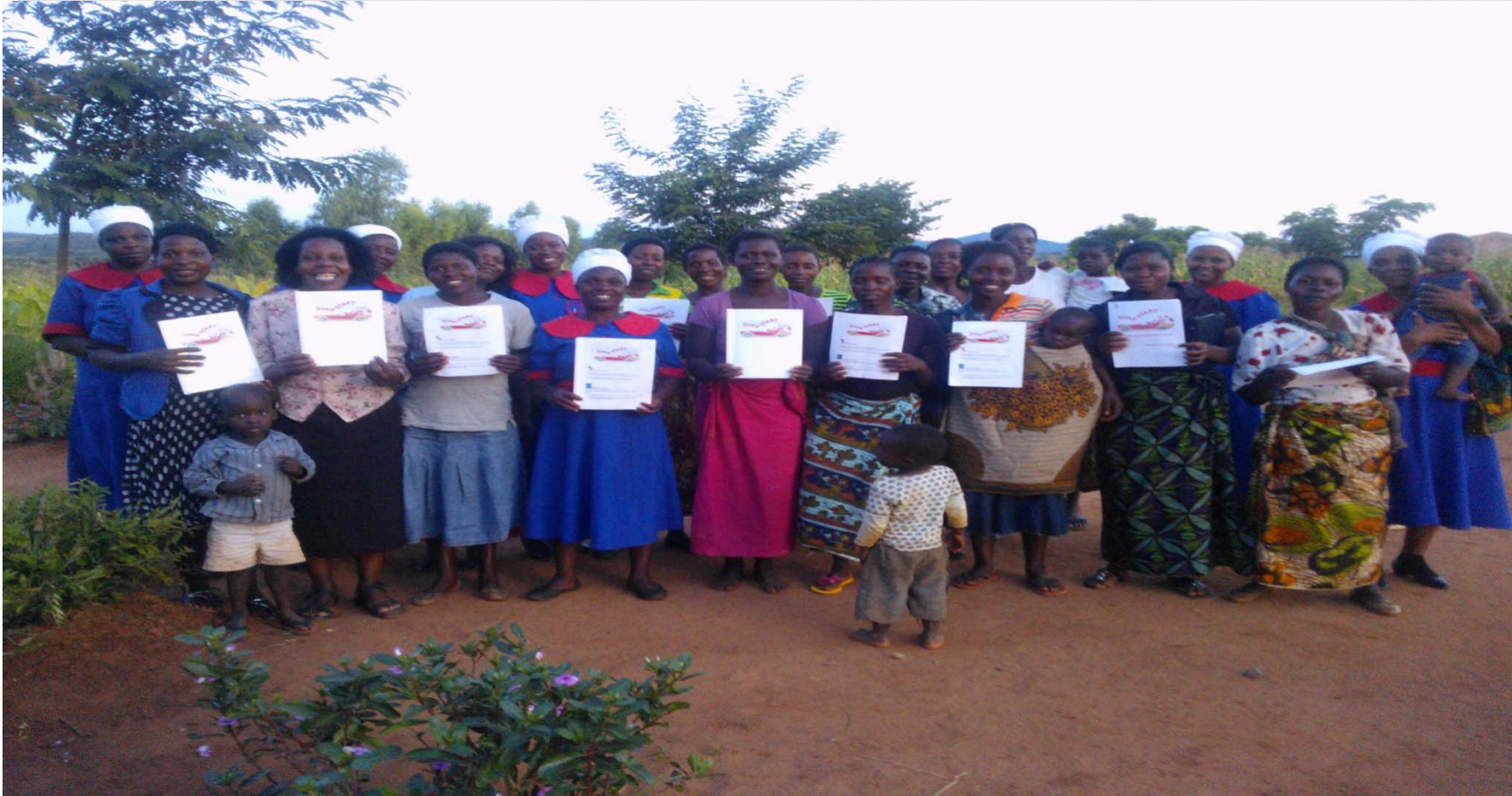
CERTIFICATES FOR SOAP MAKING TRAINEES