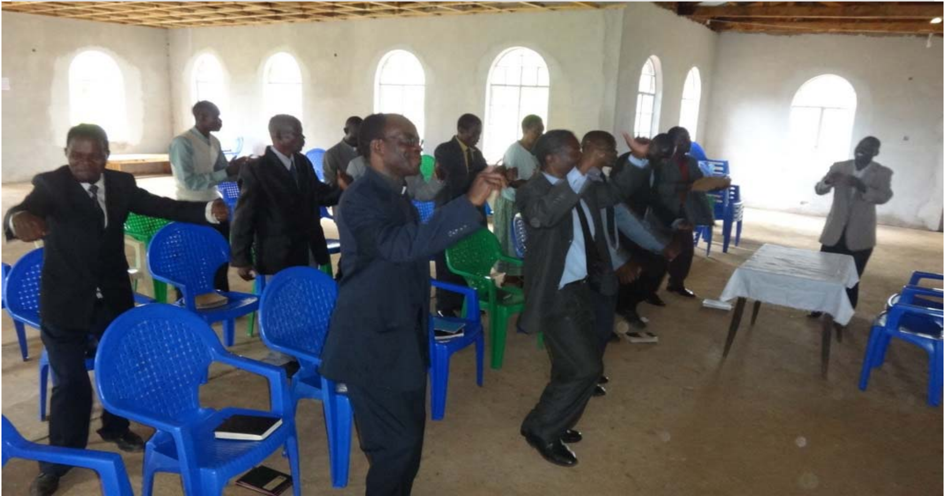
PASTORS DEVOTION DURING TRAINING