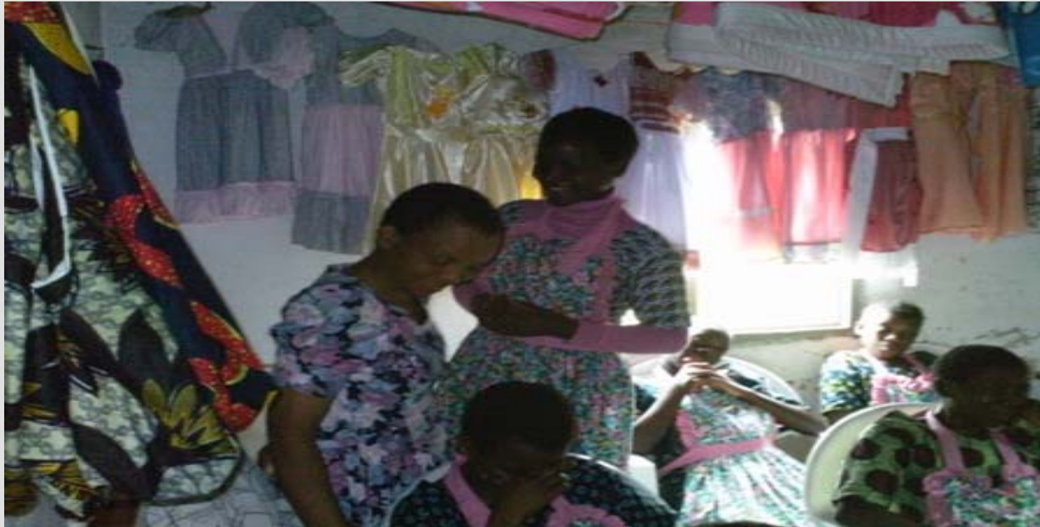
HOPE TAILORING SCHOOL-MZUZU